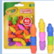
Pencil Top Erasers